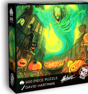
MSRP: $19.95 SKU: TPQHCP01