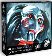
Illustration by: Terry Wolfinger MSRP: $19.95 SKU: TPQPCP01