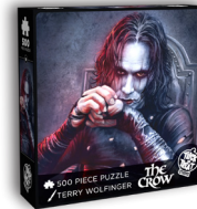
Illustration by: Terry Wolfinger MSRP: $19.95 SKU: TPQELP01