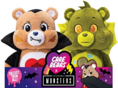
HANGTAG in Tray: 10" W x 5.5" H x 14" D