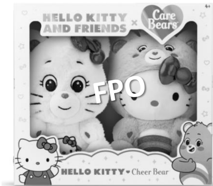
Acetate Window Box: 12" W x 4" D x 10" H