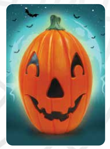
22" Pumpkin 55841 w/Light