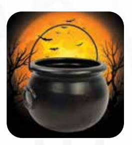
Cauldron w/Handle 55280 8" Black