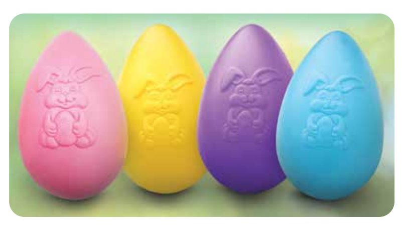
Set of 4, Large 14" Eggs Assorted Colors Item #69041