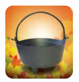
Dutch Kettle 55240 14"