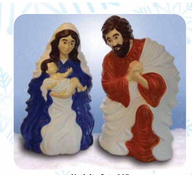
Nativity Set - 28" 74100 LED Blub